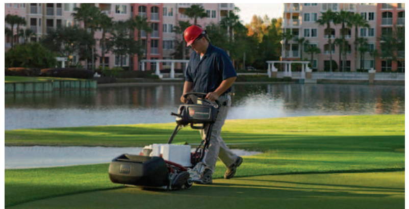
An automated easy-turn feature that provides better control and improved productivity is just one of the benefits and improvements to greens mowing offered by the Toro eFlex. Call PTP to set up a demo today.