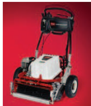
The Toro eFlex is the industry's first-ever lithium-ion-powered all electric mower, available in 18-inch and 21-inch models.