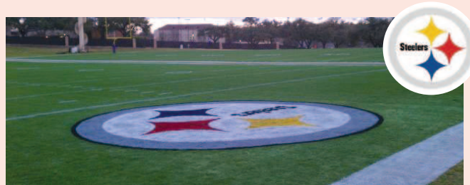
The AFC Champion Pittsburgh Steelers practiced at TCU in preparation of Super Bowl XLV as evidenced by the Steelers' logo painted on the football practice fields at TCU.

A: There's a totally new plumbing system with a six-diaphragm pump that doubles the available flow for the heavy-volume demands of spraying high rates. The new spray tank also has side-mounted agitation nozzles, which "roll" the tank contents to suspend wetttable powders and water-soluble granules. It's a more efficient way to maximize spray-out and material utilization.