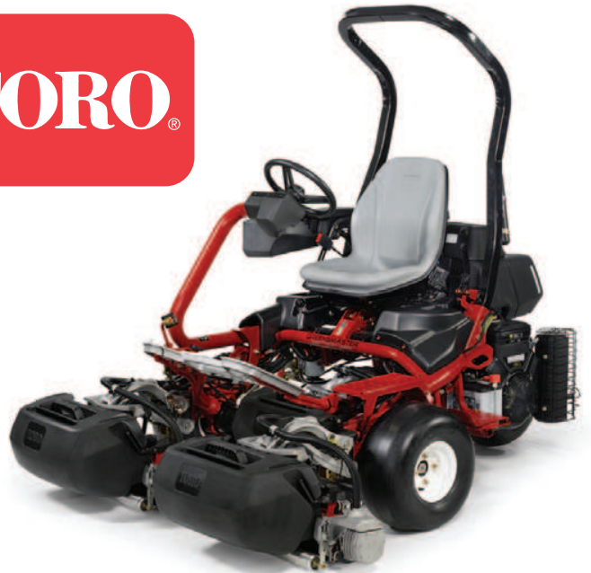
The Greensmaster TriFlex Hybrid riding mower is one of the first "Energy Smart" labeled products offered by The Toro Company.